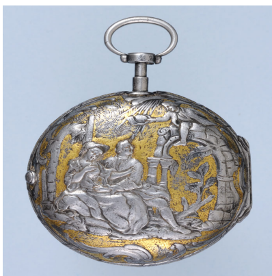
RARE GOLD DECORATED WATCH AND CHATELAINE £18,000.00