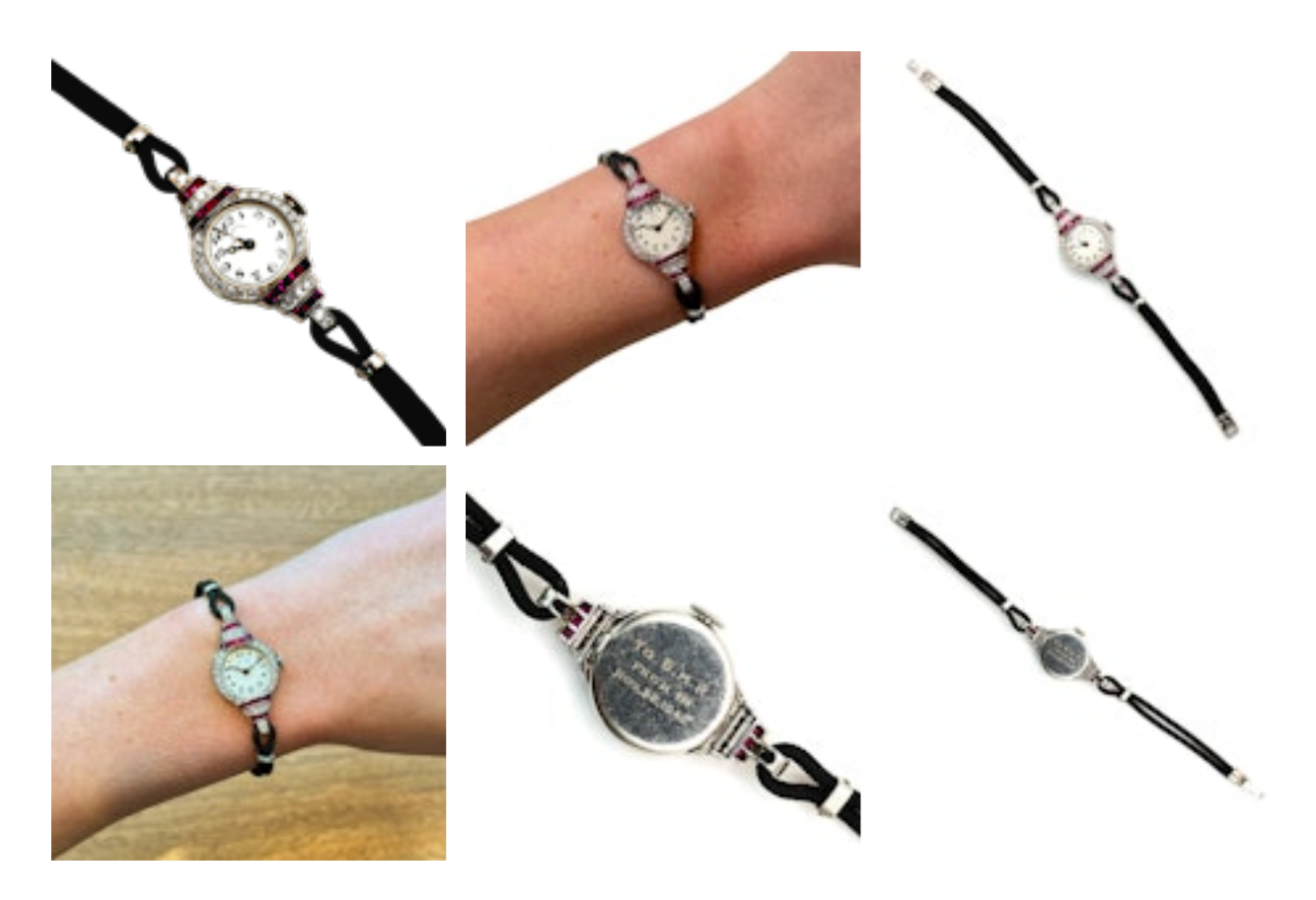
Tiffany & Co. Art Deco Ruby Diamond and Platinum Cocktail Watch With Double Cord Strap £9,950.00

A Tiffany & Co., Art Deco, ruby diamond and platinum cocktail wristwatch, with a circular, white dial, with black Arabic numerals, signed Tiffany & Co., with blue steel hands, with a winding crown, with a curved crystal, surrounded by Swiss-cut diamonds in a circular platinum case. Each tapering shoulder is set with two rows of square-cut, calibré rubies, flanking a row of Swiss-cut diamonds, onto links, set with two Swiss-cut diamonds, attaching a black double cord strap, with a folding snap clasp. The watch is mounted in platinum, with a two part case, engraved on the back To S.M.R. from HH Nov. 28. 1942, numbered 65857, the inside of the case is marked irid and plat and has a crescent and arrow mark, and is numbered 45146, along with numerous service record numbers. The movement is signed C. H. Meylan, Brassus, Swiss, eighteen 18 jewels, 5 adjmts and is numbered 41325, with a crescent and arrow mark.