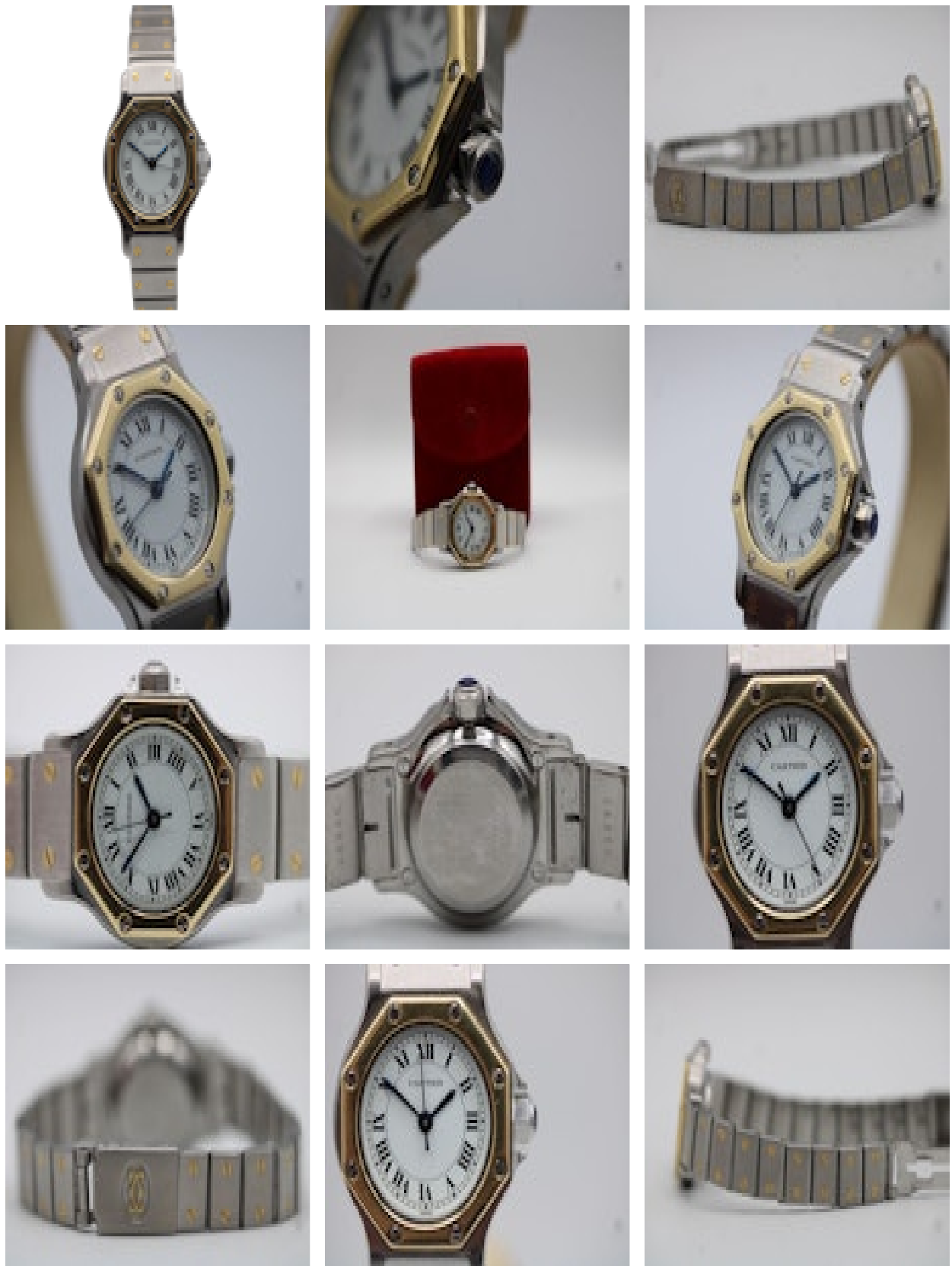
Cartier Santos Octagon 25mm 0907 Watch Only £1,895.00