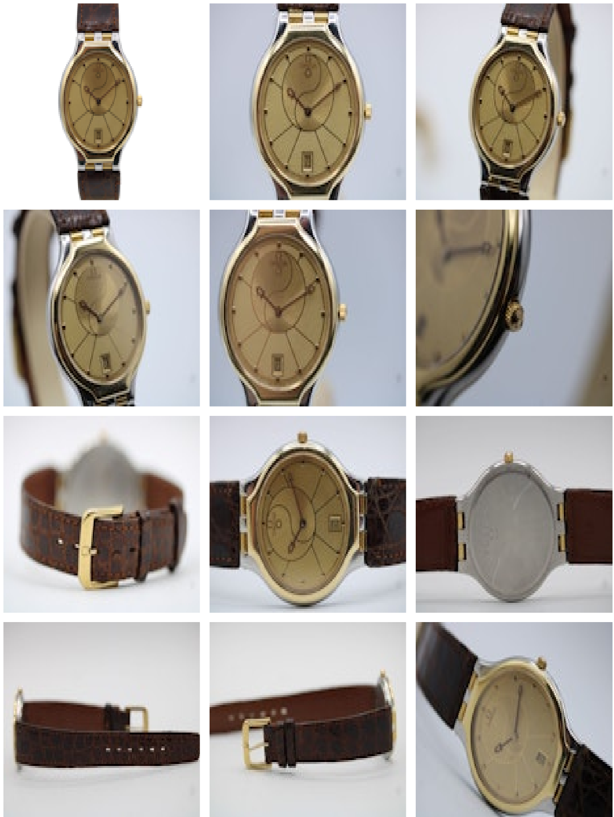
Omega De Ville Quartz Ying Yang Dial 196.0316 £695.00