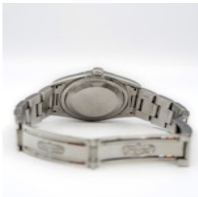
1996 Rolex Datejust 16200 - Tropical Dial 'Aventurine Stone Patina' POA