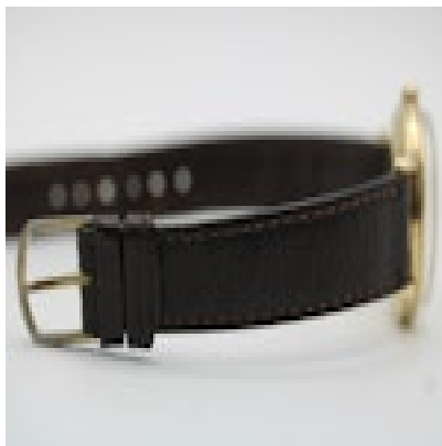
Omega Gold Filled Bumper F6212 £995.00