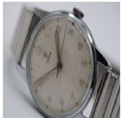
Tudor Prince 12856 £995.00