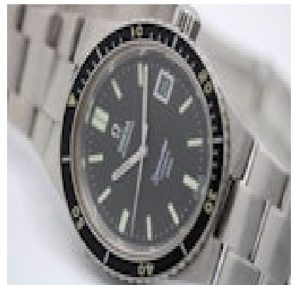
Omega Seamaster Cosmic 2000 166.137 £1,850.00