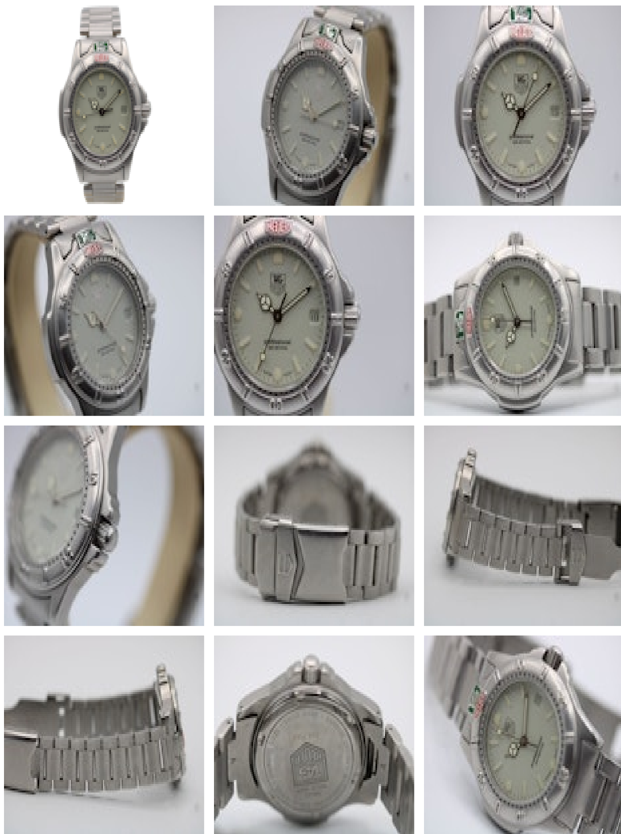
TAG Heuer Professional 200MT £495.00