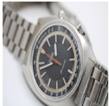
Omega Seamaster Chronostop 145.007 £1,495.00