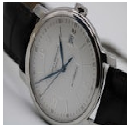
Baume & Mercier Classima 65615 £895.00