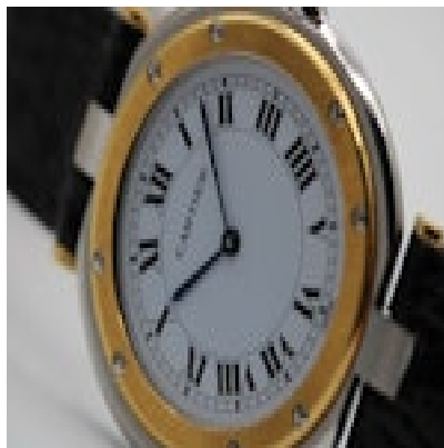
Cartier Santos 8191 £1,500.00