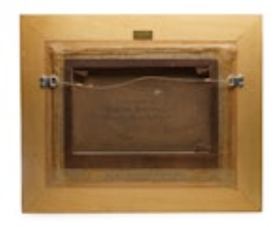
H. Stannava 19th Century Painting with rural village scenery £875.00