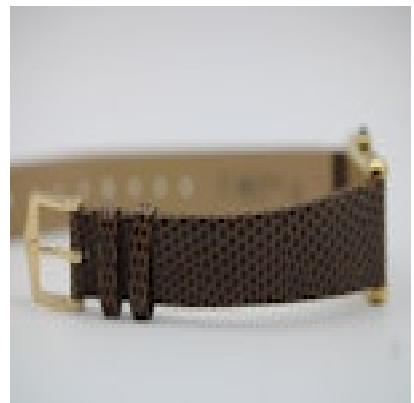
CARTIER Must De Cartier Tank Vermeil 156376 £1,650.00