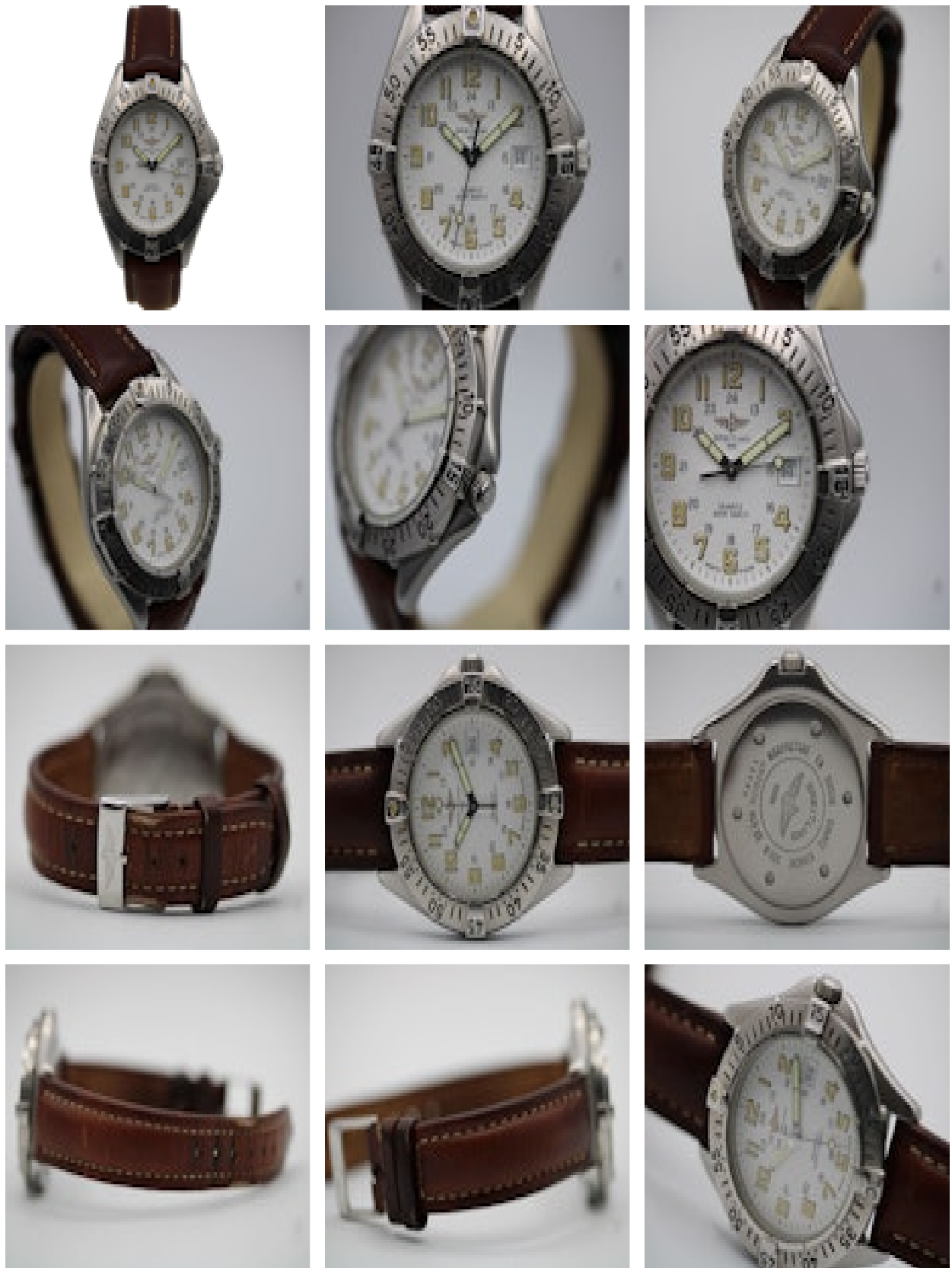
BREITLING Colt A57350 Quartz £895.00