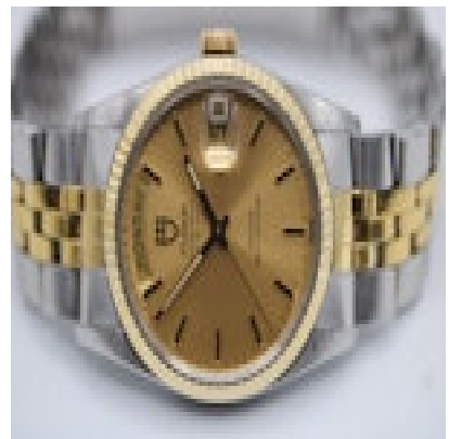
Tudor Day Date £2,450.00