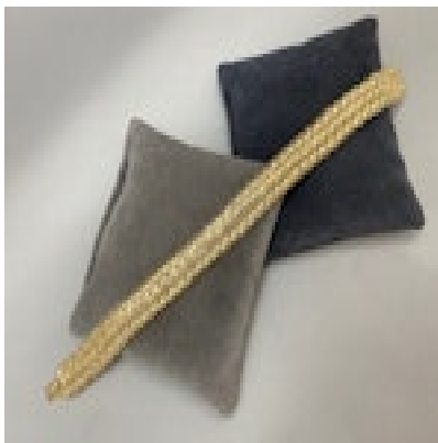
Tiffany & Co Bracelet in 14ct Gold date circa 1950, SHAPIRO & Co £2,750.00