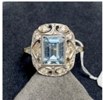
Aquamarine Diamond Ring in 18ct Gold/Platinum date circa 1950, SHAPIRO & Co since1979