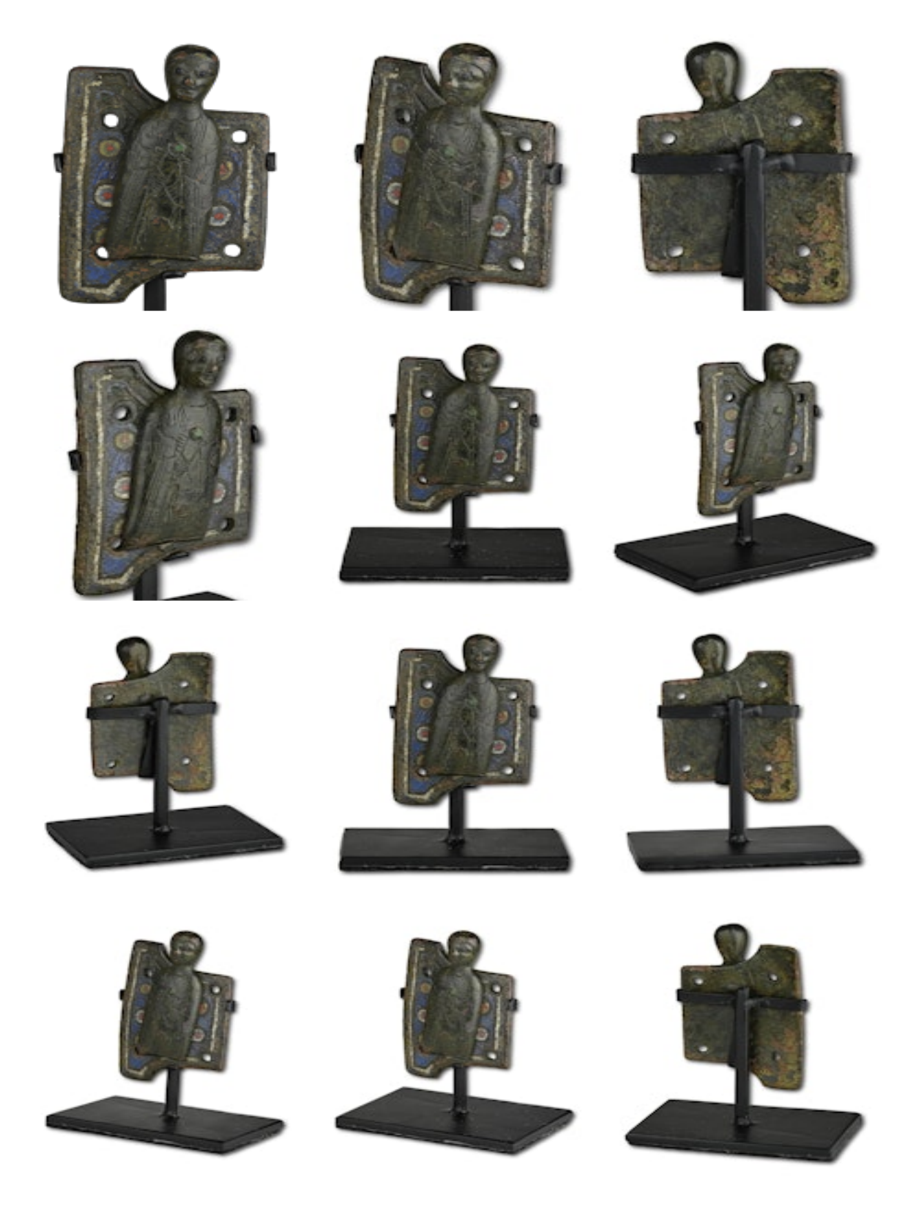
Champlevé enamelled copper appliqué of a Saint. French, Limoges, 13th century.