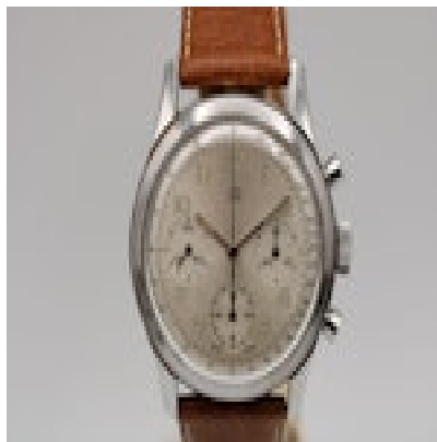
UTI Toptime Chronograph 17765-5 £2,450.00