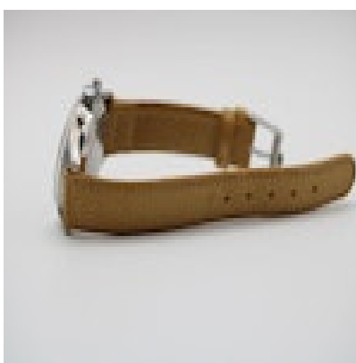
Omega Seamaster Chronograph 2451 £4,595.00