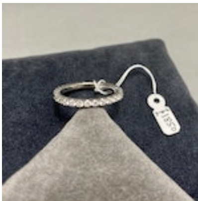
Diamond Eternity Ring in 18ct White Gold date circa 1980, SHAPIRO & Co since 1979