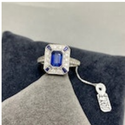
Sapphire Diamond Ring in 18ct White Gold date circa 1980, SHAPIRO & Co since 1979