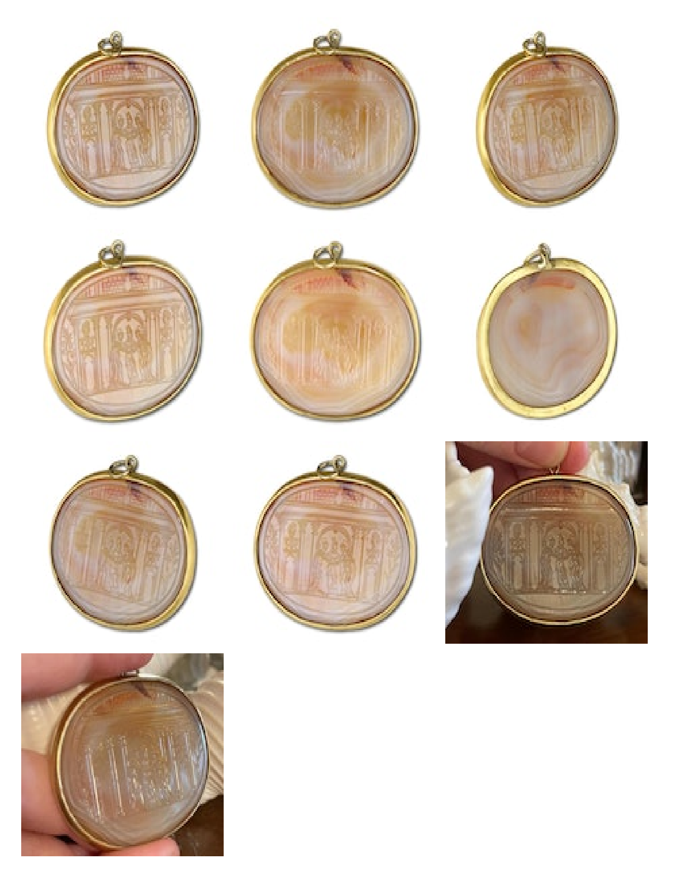
Large agate intaglio depicting the marriage of the Virgin. Italian, 17th century