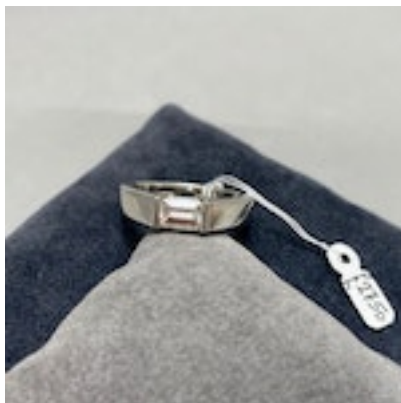
Emerald Cut Single Stone Ring in Platinum dated 2001, SHAPIRO & Co since 1979