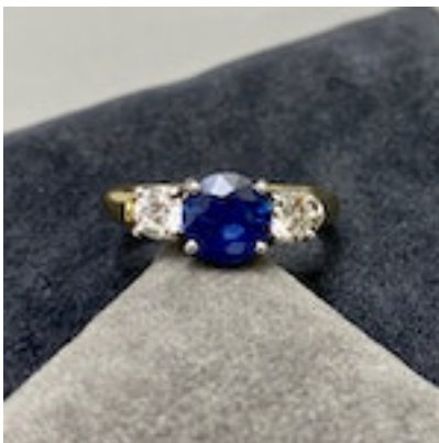
Sapphire Diamond Three Stone Ring in 18ct Yellow/White Gold date circa 1970, SHAPIRO & Co since1979