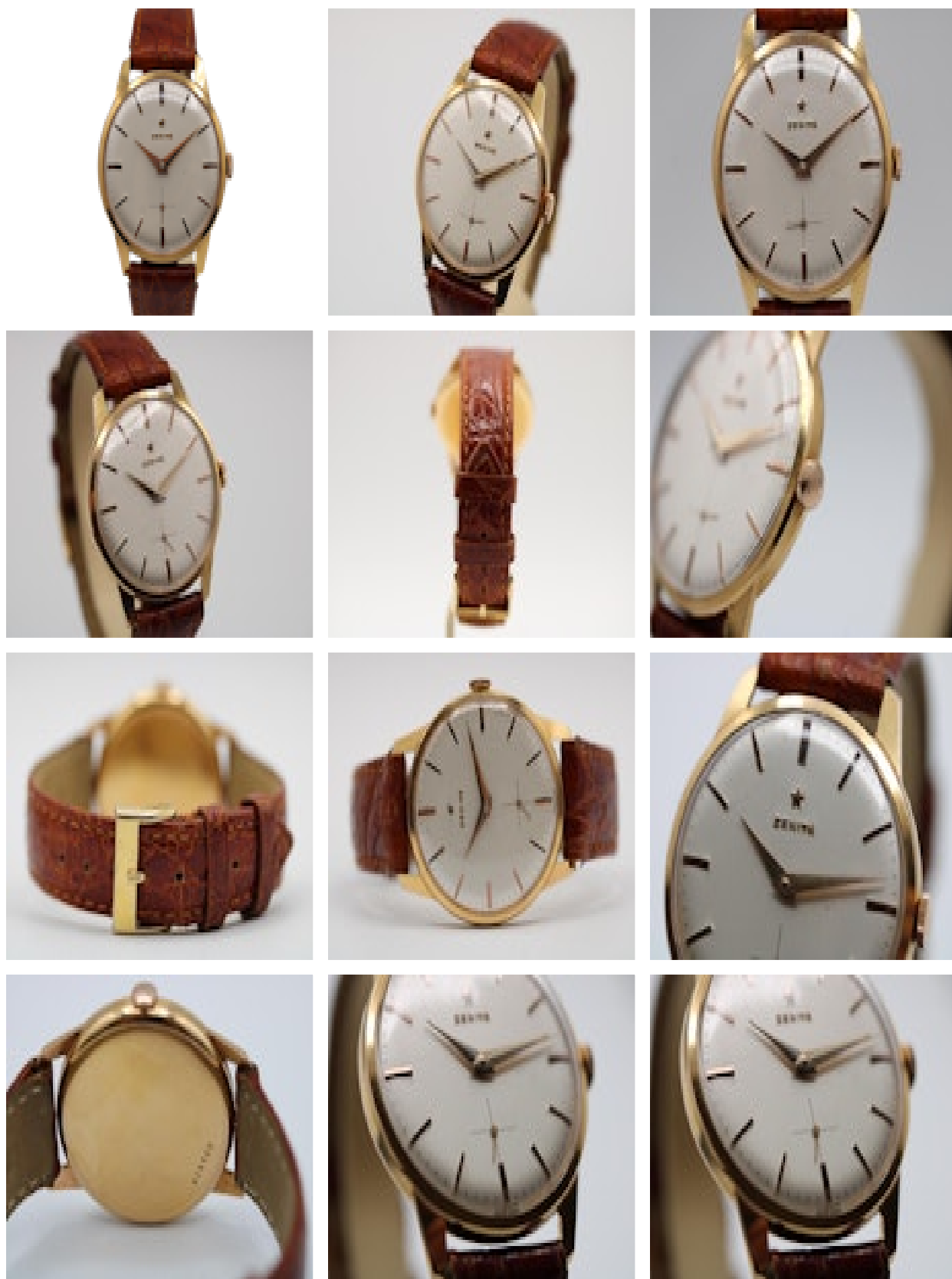
Zenith 18ct Rose Gold Cal.40 £1,800.00