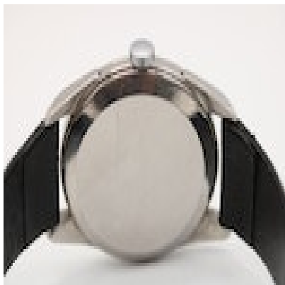
Omega Vintage 2791 c.1950s Honeycomb Dial £1,095.00