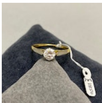
Single stone Diamond Ring in 18ct Yellow/White Gold dated London 1963, SHAPIRO & Co since1979