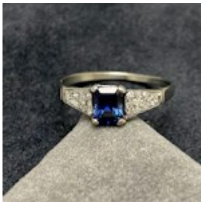
Sapphire Diamond Ring in Platinum date circa 1940, SHAPIRO & Co since 1979