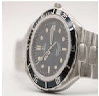
Omega Seamaster 368.1051 £2,250.00