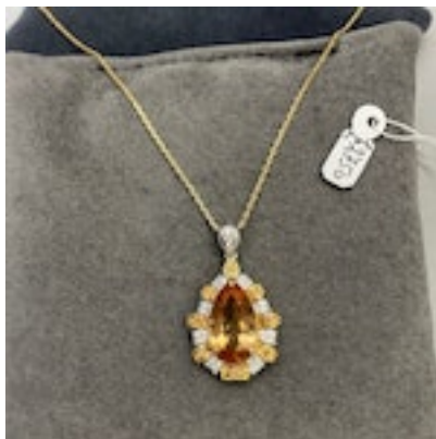
Imperial Topaz Diamond Pendant in 18ct Gold date circa 1980, SHAPIRO & Co since 1979