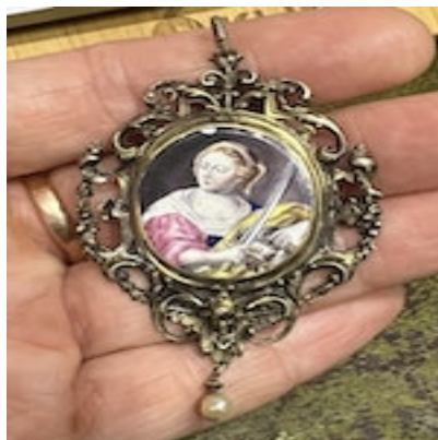
Silver gilt pendant with an enamel of Judith with the head of Holofernes. £850.00