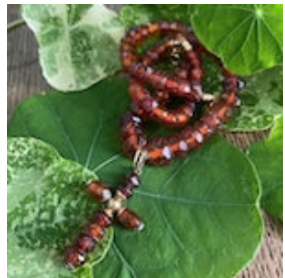
Gold and faceted amber necklace. European, 19th century. £450.00