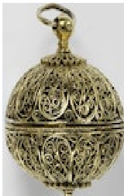
Collection of the Victorian and Albert Museum, registration number: 3288&A-1864.