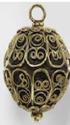
Collection of the Victorian and Albert Museum, registration number: 849-1892.