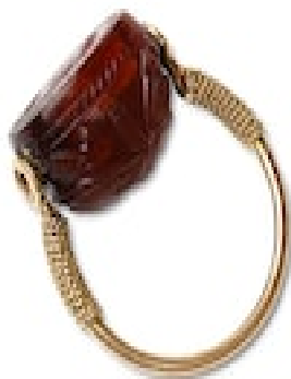
Grand tour gold ring with a carnelian scarab. Italian, 19th century. £850.00