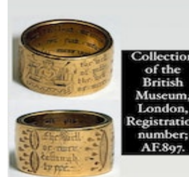
Collection of the British Museum, London, Registration number; AF.897.