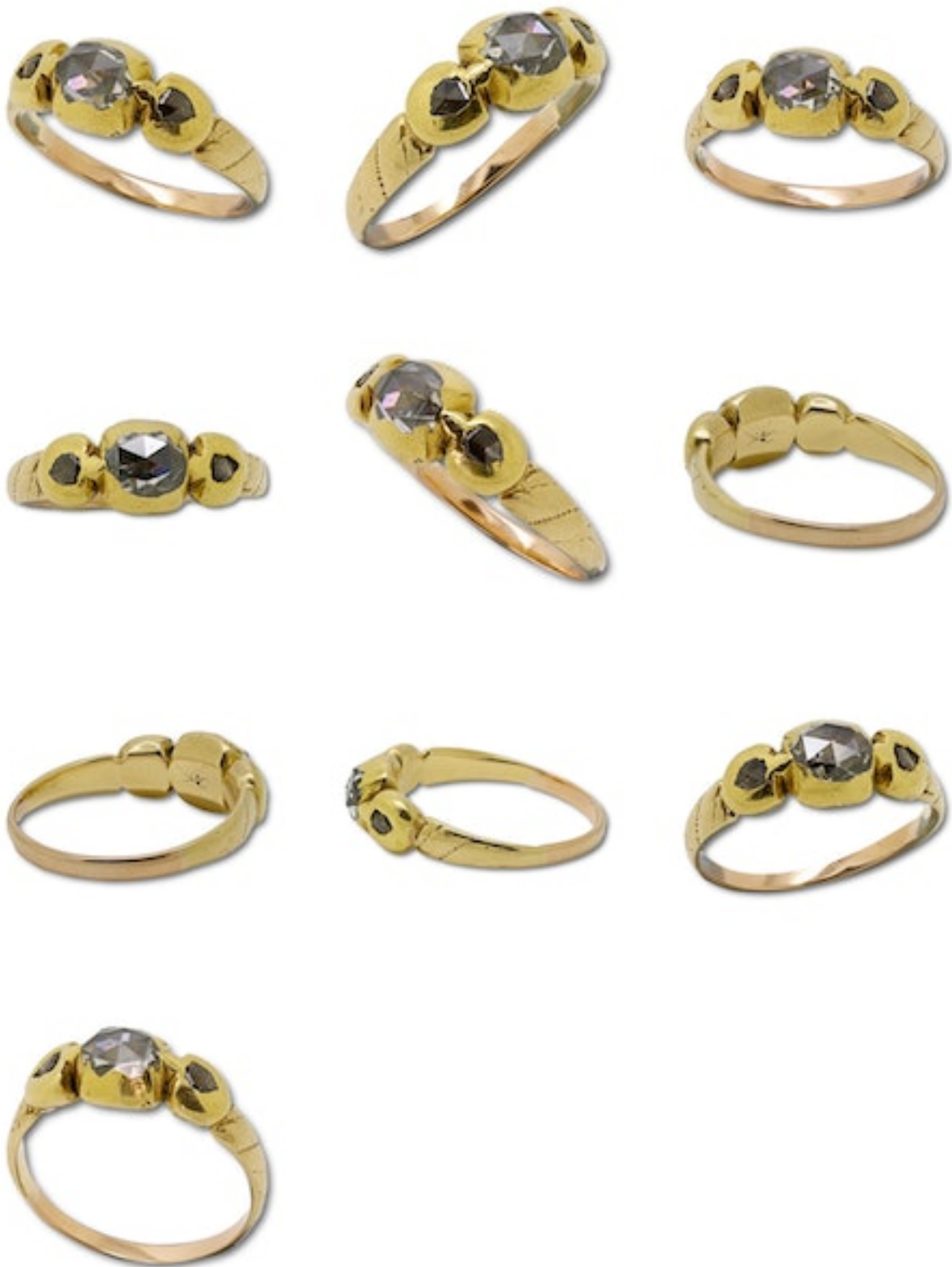
Rose cut diamond set gold ring. North European, late 17th century. £2,850.00