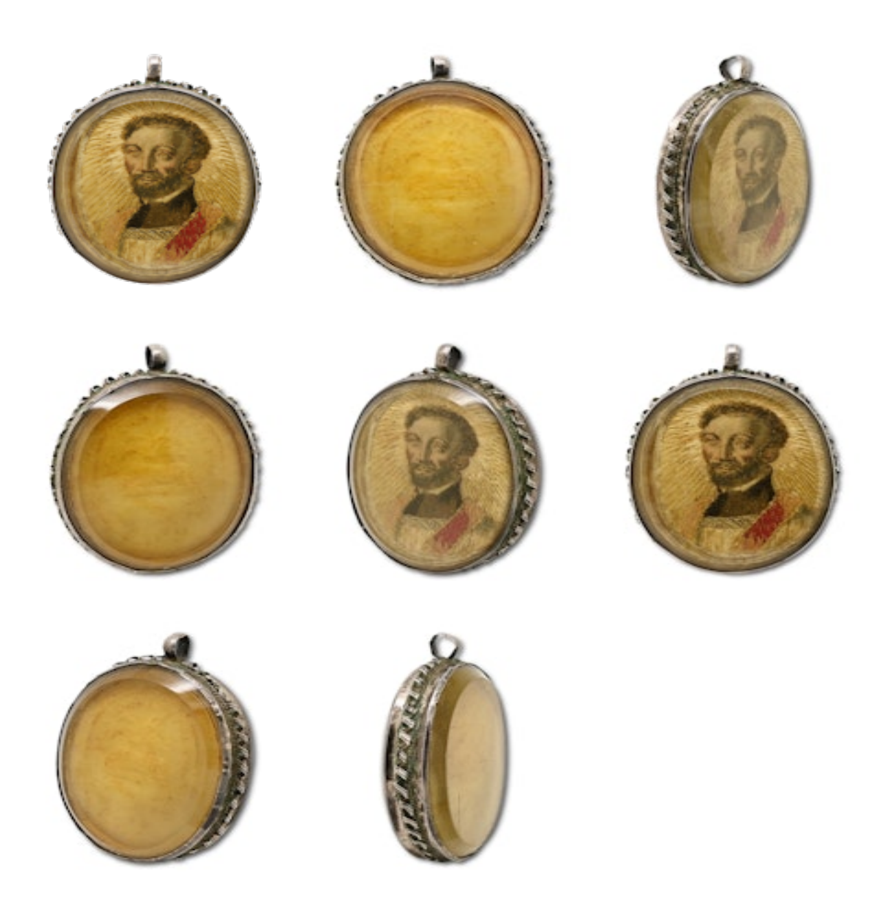
Silver pendant with a needlework picture of Saint Francis. Spanish, 18th century £685.00