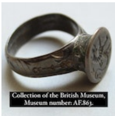
Silver signet ring engraved with a lion. Hungarian, 17th century. £1,250.00