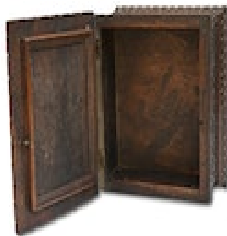
Walnut casket with concealed money box. Italian, 16th / 17th century. £1,650.00