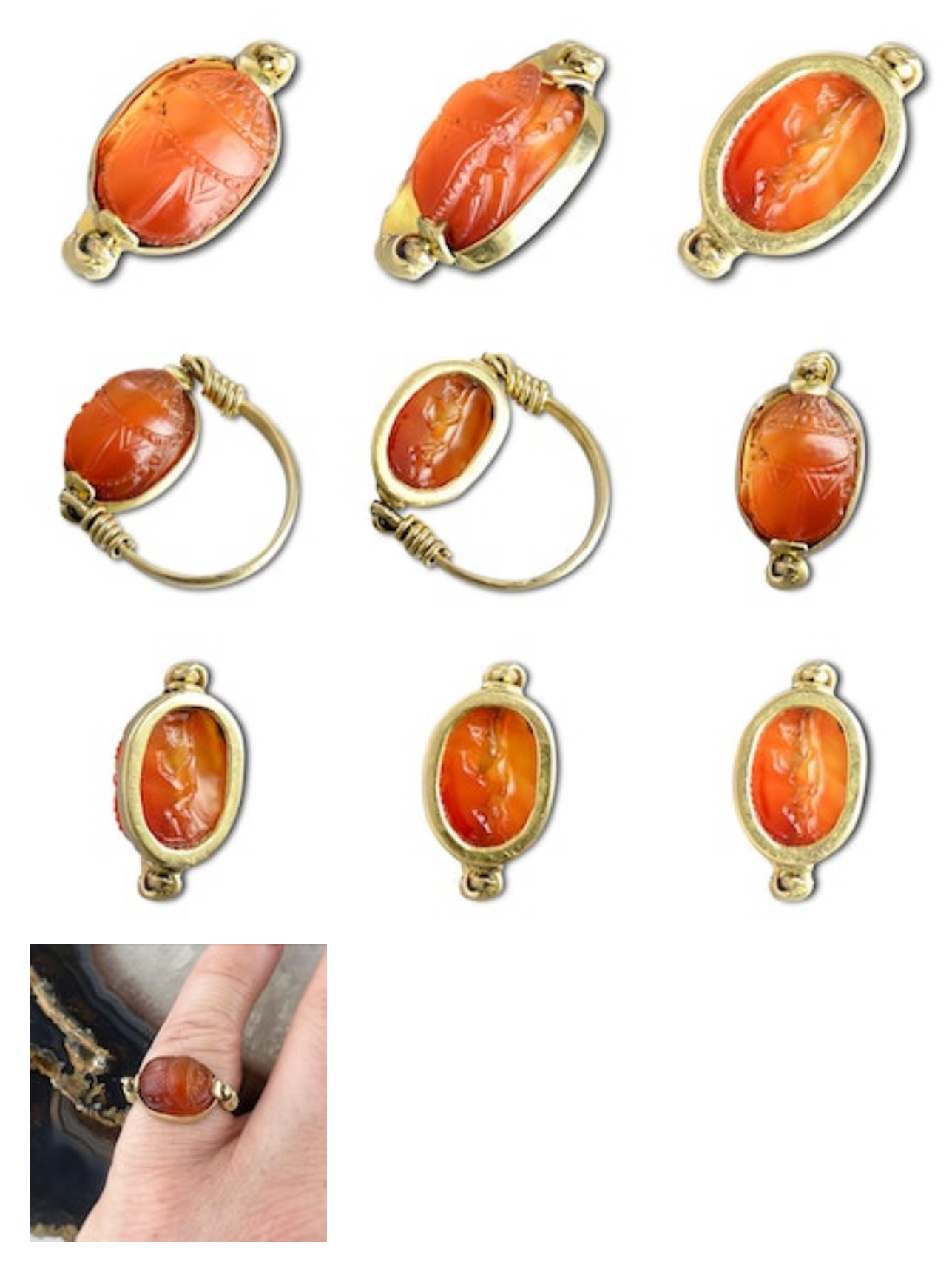
Gold ring with an Etruscan carnelian scarab of a figure carrying an amphora.