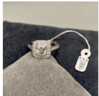
Asscher Cut Diamond E colour Ring in Platinum Date circa 1980, SHAPIRO & Co since 1979