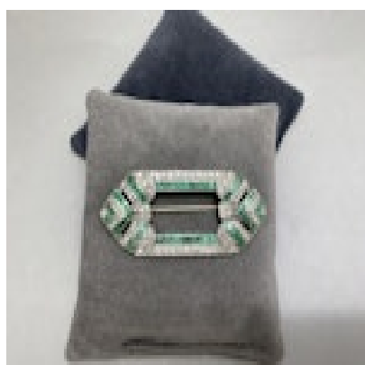
Emerald Diamond Brooch in Platinum date circa 1920, SHAPIRO & Co since 1979