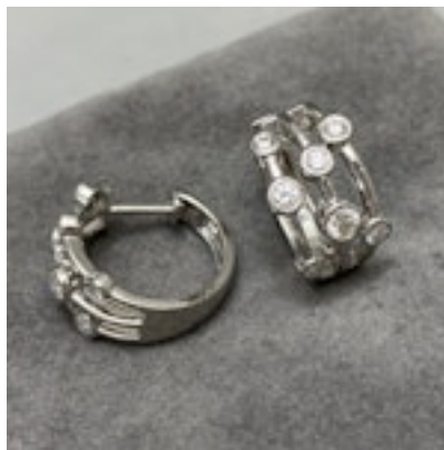
Hoop Diamond Earrings in 18ct White Gold date circa 1980, SHAPIRO & Co since 1979