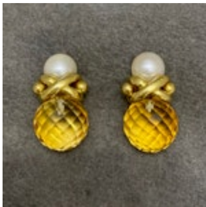
Citrine Pearl Earrings in 18ct Gold by Kiki McDonough dated Birmingham 2001, SHAPIRO & Co since 1979